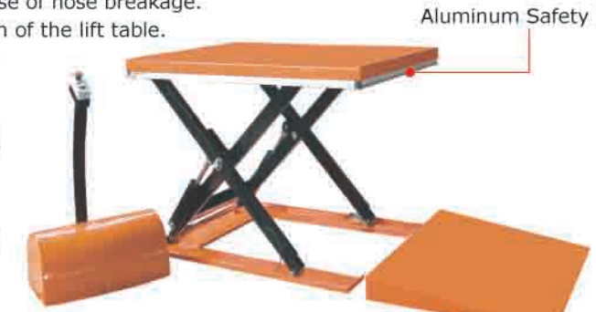
Aluminum Safety Bar