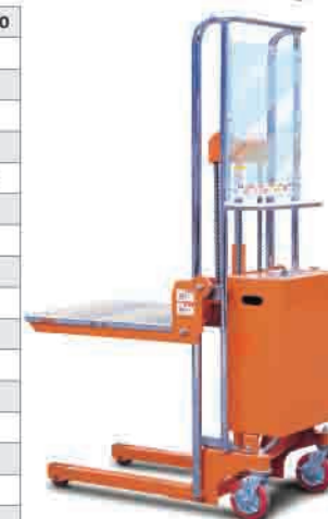
With safeguard organic glass