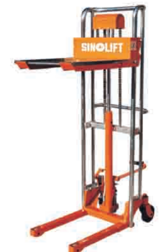
Standard platform type