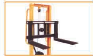
Standard adjustable forks