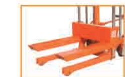
B. Optional fixed forks