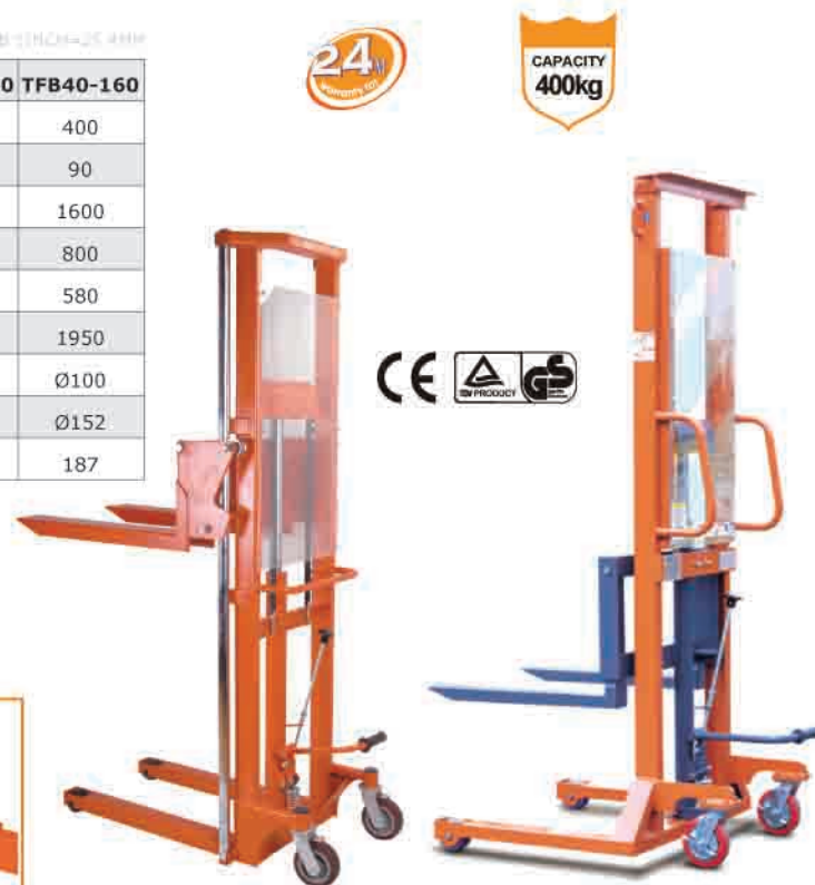
Type (I) ↑