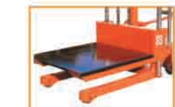
A. Standard platform