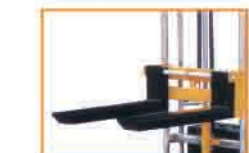
C. Optional adjustable forks