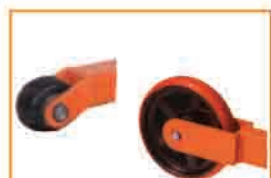
Ø100,Ø150,Ø200,Ø250 wheels are option