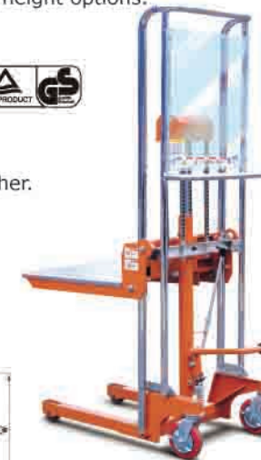
With safeguard organic glass