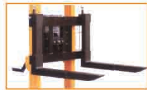
New optional adjustable forks