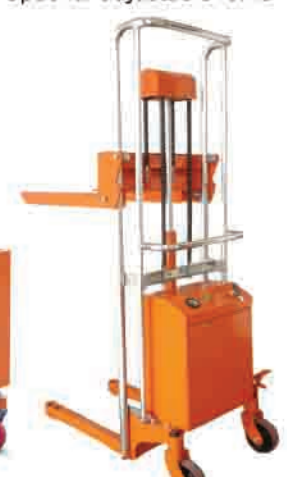
Standard platform type